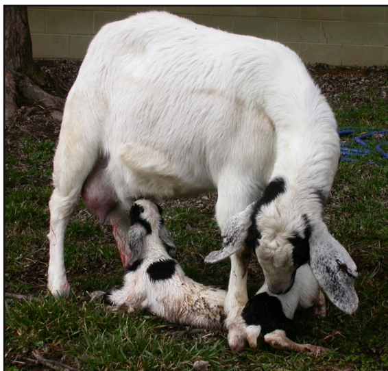
Newborns need quality colostrum.

The old farmers' method of color doesn't necessarily hold true when evaluating colostrum for quality. Testing colostrum is the only way to know the true quality of the first milk the offspring are receiving. There are many methods of testing colostrum, from a Brix to the old school hydrometer. In recent years, research has shown that the hydrometer's results can be skewed by temperature.