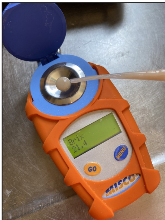
Brix refractometer

The Brix refractometer currently is the standard for testing colostrum. The Brix comes in a few different forms. The digital is pricey, but extremely easy to use. The optical brix is more wallet-friendly. Both the digital and optical brix allow for accurate results, utilizing a specific gravity scale that measures how much light is able to pass through a liquid. When selecting a brix refractometer make sure the one being purchased has a scale from 0 to at least 35.